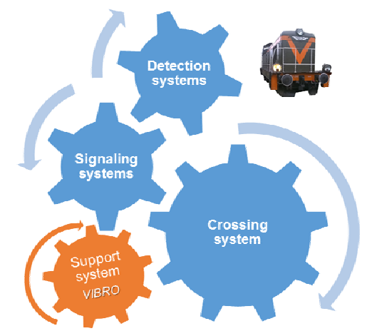
Fig. 3. Fundamentals and support of level crossing safety